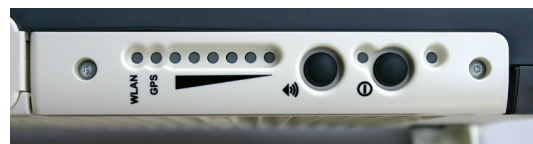
Front view detail

Designed and developed by Hughes, the world leader in broadband satellite networks and services, with more than 2.2 million terminals shipped to customers in over 100 countries.